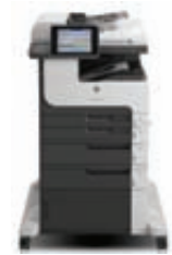
HP LaserJet Enterprise MFP M725f