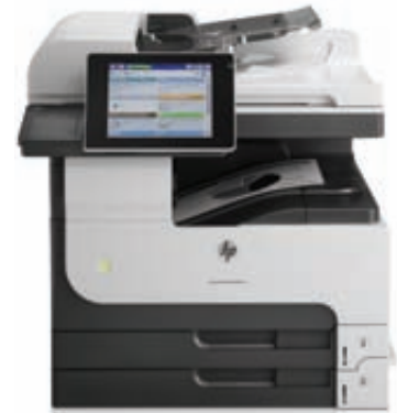
(HP LaserJet Enterprise MFP M725dn shown)

Mobile printing capability: HP ePrint, Apple AirPrint™