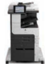
HP LaserJet Enterprise MFP M725z+