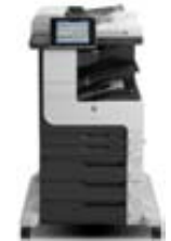
HP LaserJet Enterprise MFP M725z