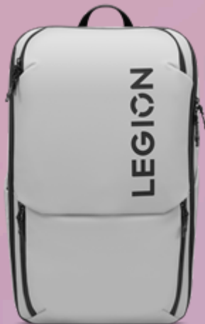
Lenovo Legion 17" Gaming Backpack GB800 (Light Gray) GX41U39300

Please click here to view the full list of accessories.