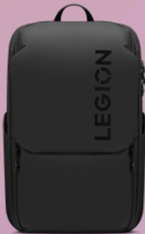
Lenovo Legion 17" Gaming Backpack GB800 (Black) GX41U39299

Please click here to view the full list of accessories.