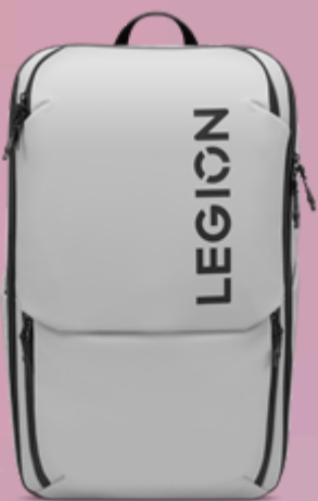
Lenovo Legion 17" Gaming Backpack GB800 (Light Gray) GX41U39300