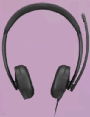
Lenovo Wired VoIP Headset 5000 4XD1R88995

Please click here to view the full list of accessories.