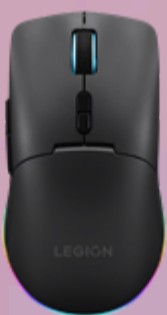
Lenovo Legion M220 Wireless RGB Gaming Mouse GY51U28359